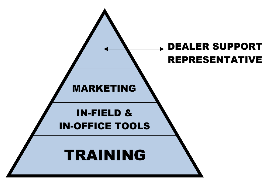
Figure 1: GFC' Multi-Tier Dealership Support Pyramid